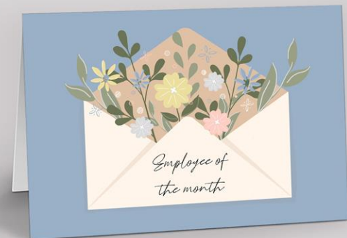
A6 'EMPLOYEE OF THE MONTH' CARD DESIGN ILLUSTRATED BY HANNAH NEEDHAM DESIGN